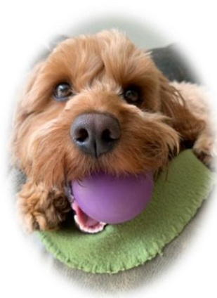
Bella – School Dog