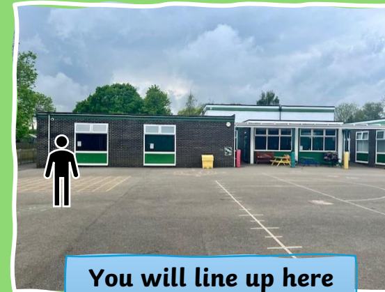
You will line up here on the playground.