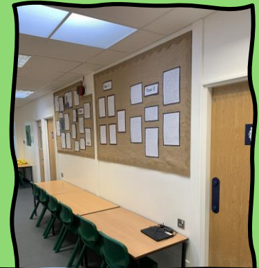
The toilets can be accessed from the corridor outside your classroom.