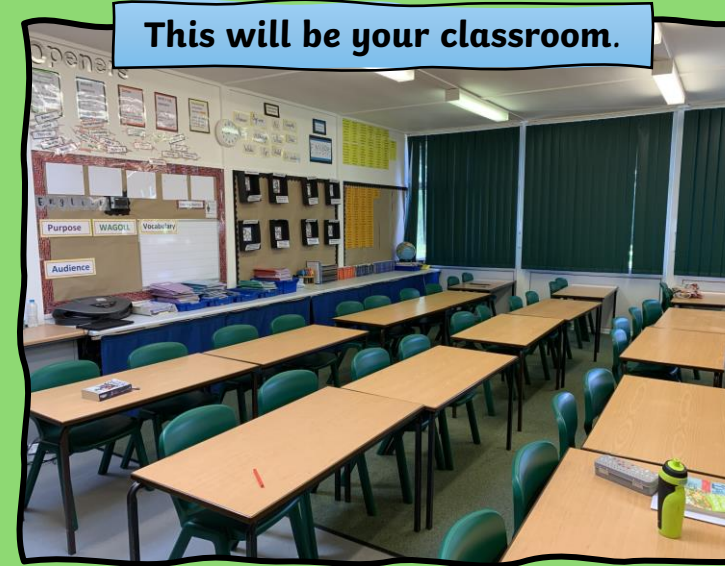
This will be your classroom.