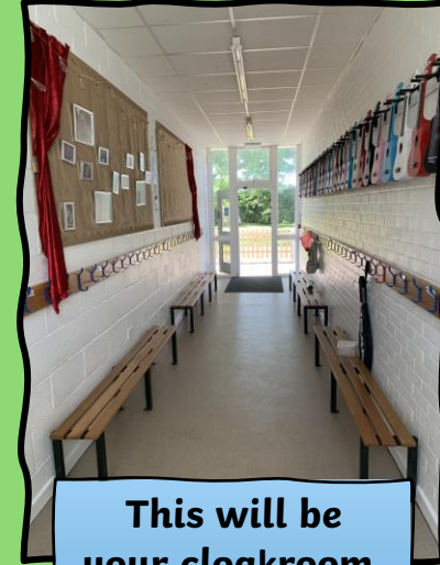
This will be your cloakroom.