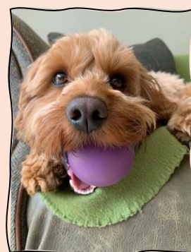
Bella (our school dog)