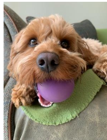
Bella School Dog